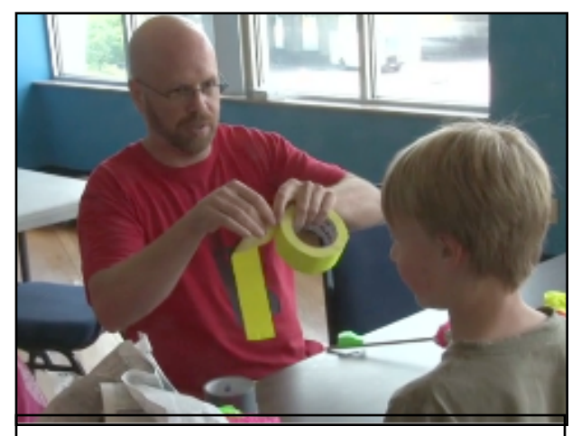
A play entitled Monkey Mind Pirates is teaching children not only how to perform in a theater group, but also how to deal with ADHD, Anxiety, and Depression.